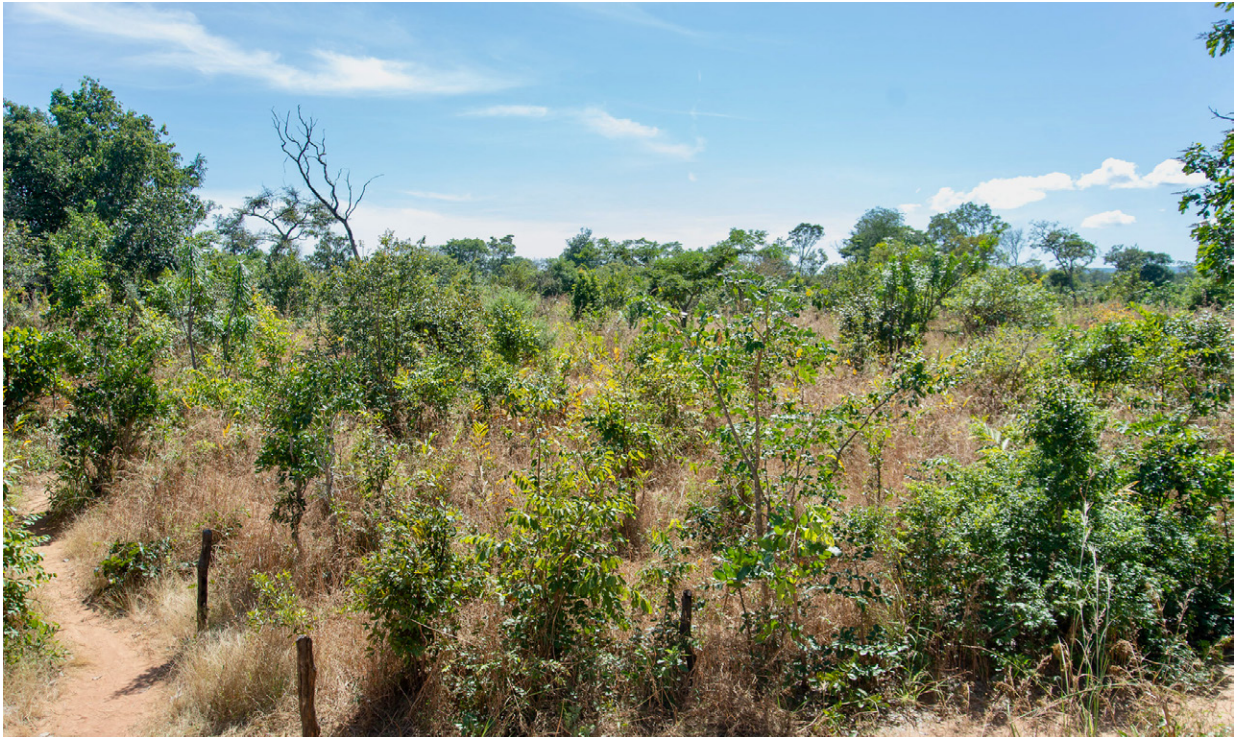
Assisted natural regeneration demonstration plot