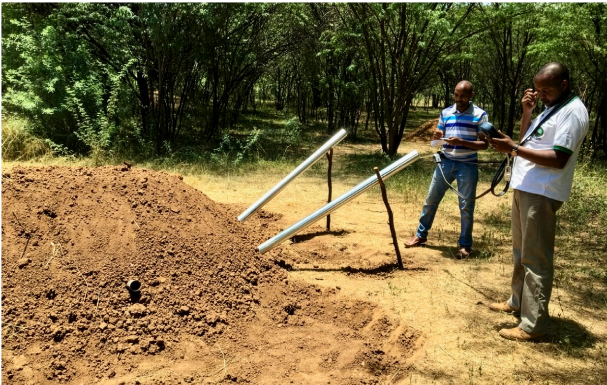
Measuring emissions from an improved earth mound kiln in Baringo, Kenya

Wood carbonization remains wasteful, adding to the inefficiencies that make the charcoal value chain unsustainable. In Baringo County, most charcoal makers use traditional earth mound charcoal kilns that have low wood-to-charcoal conversion rates. According to an action research with charcoal producers in the county, using Prosopis wood improved traditional earth mound kilns, increased charcoal yield by 50% per mass of wood, reduced emissions by over 40% and the small stems and branches of 5 centimetres in diameter produced good quality charcoal with 28 kilojoules per gram (Njenga et al. 2023). ii The simple improvements included improving air circulation by fixing breathers at a cost of USD 50, drying wood before combusting and stacking wood tightly in the kiln (Schure et al. 2021). Thus, improved carbonization practices and technologies could reduce unnecessary cutting of trees and associated GHG emissions. Ultimately, then, use of improved charcoal stoves reduces charcoal consumption and thus emissions. Cooking with the Jikokoa – an industrial charcoal stove – reduced charcoal consumption by 6% to 26% compared with Kenya Ceramic Jiko, a small and medium-sized artisanal charcoal-burning stove (Kirimi et al. 2023).